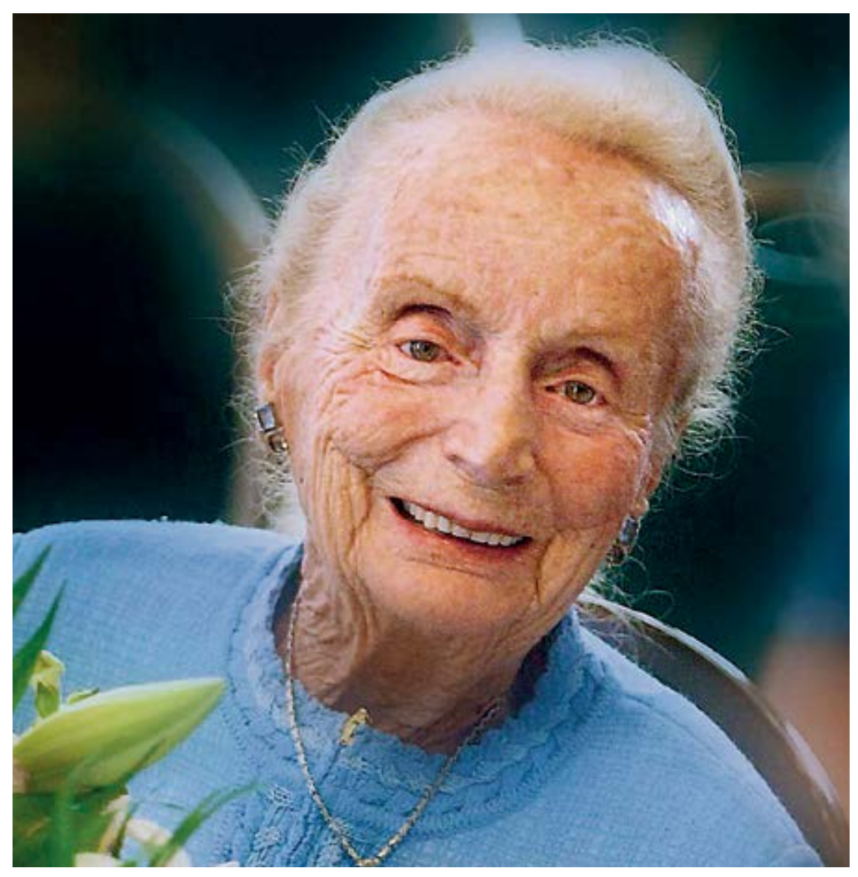
"My many years have taught me that there will always be conflict. It's part of human nature. But I'll remind you that love, kindness, and support are also part of human nature. My challenge to you is to bring about a mindset of preparing for peace, instead of preparing for war."