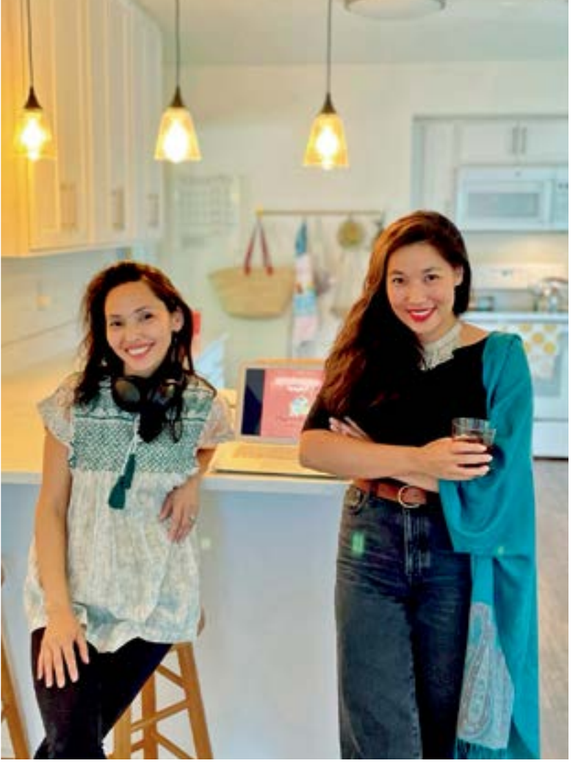
"The CwD team defines peace as a setting void of war, conflict, economic, social and political instability, persecution and violation of human rights....the ability for people of all backgrounds to feel safe and thrive."