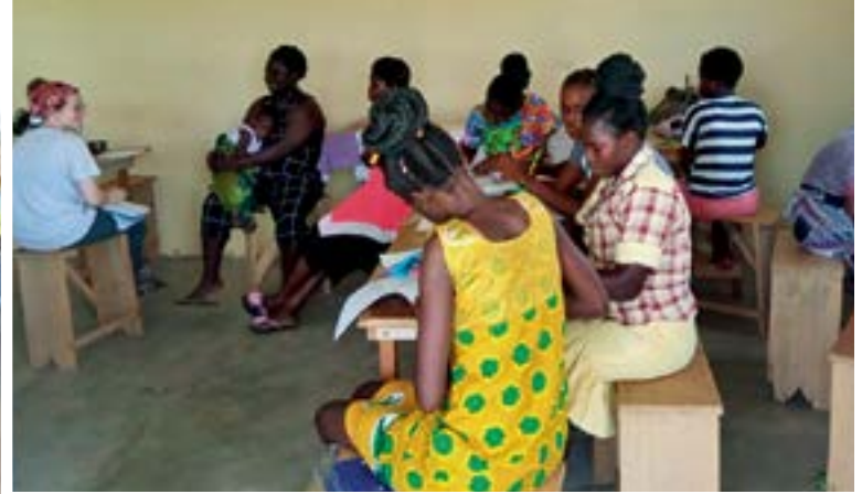
"People's lives are hard, and they are hard all over the world in different ways. Peace is about understanding this hardship, and embracing the exchange of both ideas and lifestyles."