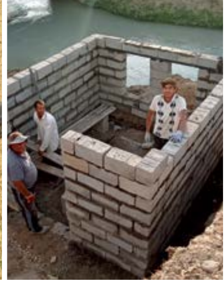
"I visualize peace as the ability for people to live a life without a worry for their basic needs....having food, water, shelter, and safety."