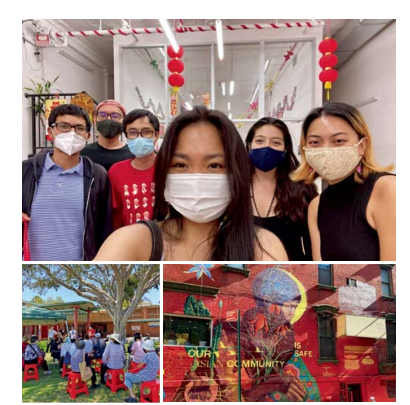
"In contexts of racial violence, it's easy for definitions of peace to collapse into tired maxims of multiculturalism and colorblind harmony....VIRAL LOVE takes peacebuilding to be a much more complex project."