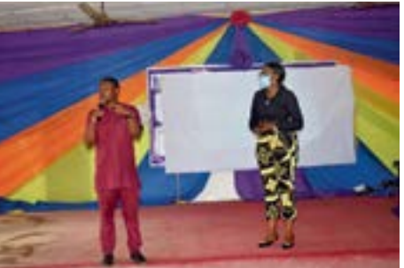
"I have learned about the stages involved in providing affordable and accessible health care.... from funding to creating awareness. This has provided me with experience working with underserved communities and deepened my interest in public health."